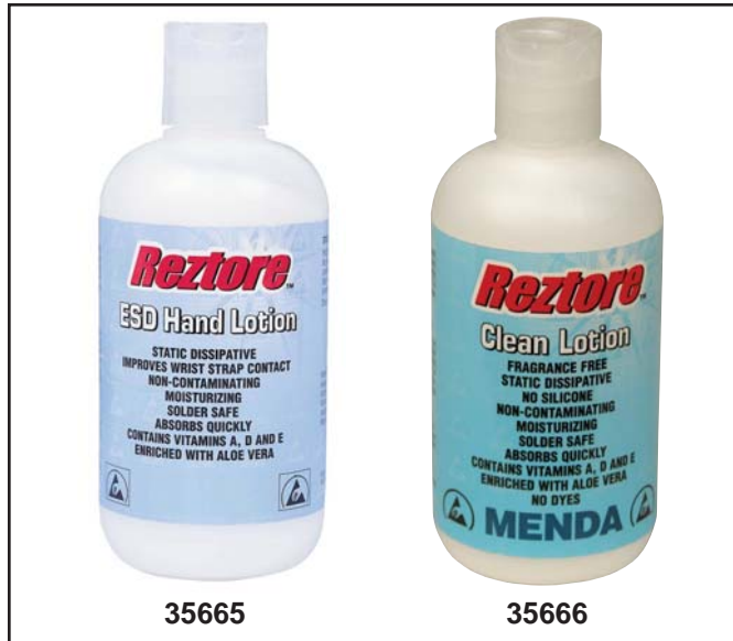
Figure 2. Reztore™ Hand Lotions, 8 oz. bottles