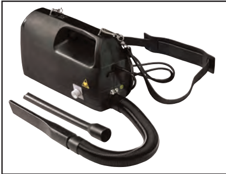
Figure 1. 91550 Vacuum Cleaner