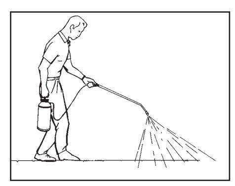
Figure 2. Compressed air sprayer in use.

Note: It is extremely important to obtain uniform coverage. Uneven application may result in uneven soil protection.