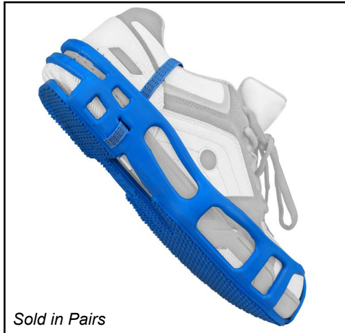
Sold in Pairs